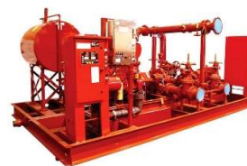
UL FM FIRE PUMP